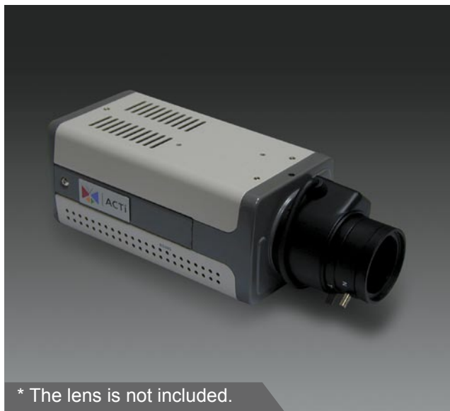
* The lens is not included.