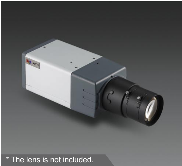
* The lens is not included.