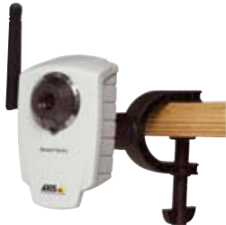
AXIS 207/207W/207MW Network Camera with flexible clamp - clamp included