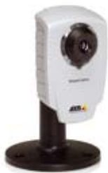
AXIS 207/207W/207MW Network Camera with camera stand - stand included