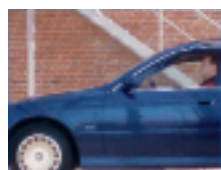
Progressive Scan, all lines are captured at the same time

Progressive scan is used instead of the interlaced method found in analog CCTV (PAL/NTSC) cameras. With progressive scan all pixels (lines) are captured at the same time, enabling moving images to be presented without distortion.